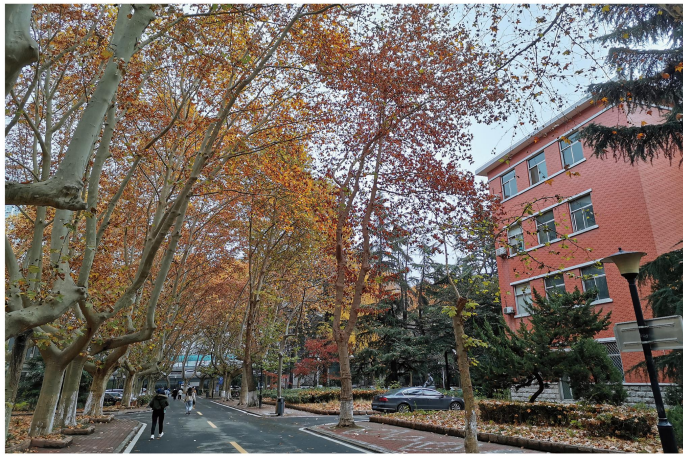
(the group photo taken after the contest)

Jiang: I felt that learning English is never a process accomplished in one action. In my daily life, I