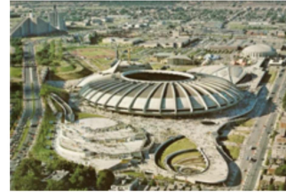
the stadium in Montreal

to pay off all the debts, which reached about 30 billion of dollars.