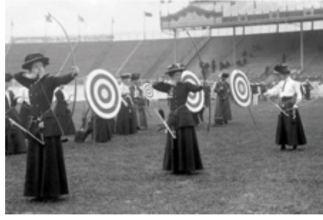
the archery competition(射箭比赛) in London

In 1900, the second Olympic Games and the 11th World Expo(世界博览会) were both held in Paris. As two of them were being held at the same time, the Olympic Games was only regarded as a part of the World Expo. So many competitors didn't realize that they participated in the Olympics Games rather than the World Expo only until the competition was over. Even some competitors didn't know they won the prize due to the disordered management.